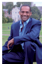
1. Rosa Parks 2. Alice Walker 3. Colin Jackson 4. Bob Marley 5. Joan Armatrading 6. Mary Seacole 7. Elijah McCoy 8. John Taylor, Conservative Party