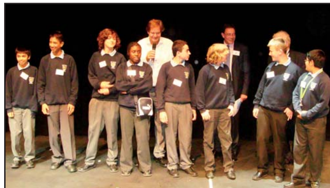
Young Einsteins: The Year 9 Serious About Science winners