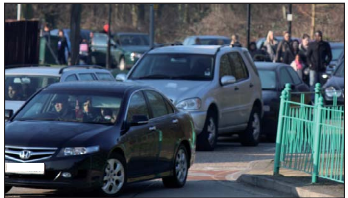
Traffic congestion on Compton Crescent

at the Compton Crescent end of the Academy site. This will be coupled with the drive to continue to raise attendance levels at the Primary Phase and build upon the high attendance levels already achieved at the High School where the majority of students walk and use public transport to get to school