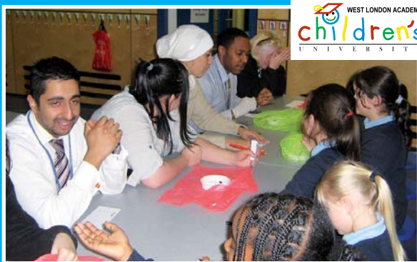
WLA staff during the Dried Fruit Tasting Session

FOLLOWING the successful community cooking event last term, WLA Children's University has set up a new and exciting cookery club every Tuesday after school. This will include club sessions and sessions open to the wider community.