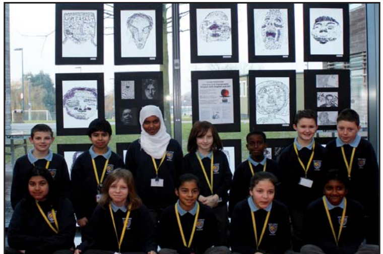
Year 7 students show off their creations

STUDENTS completed some amazing drawings as part of a Year 7 English and Art Cross Curricular project.