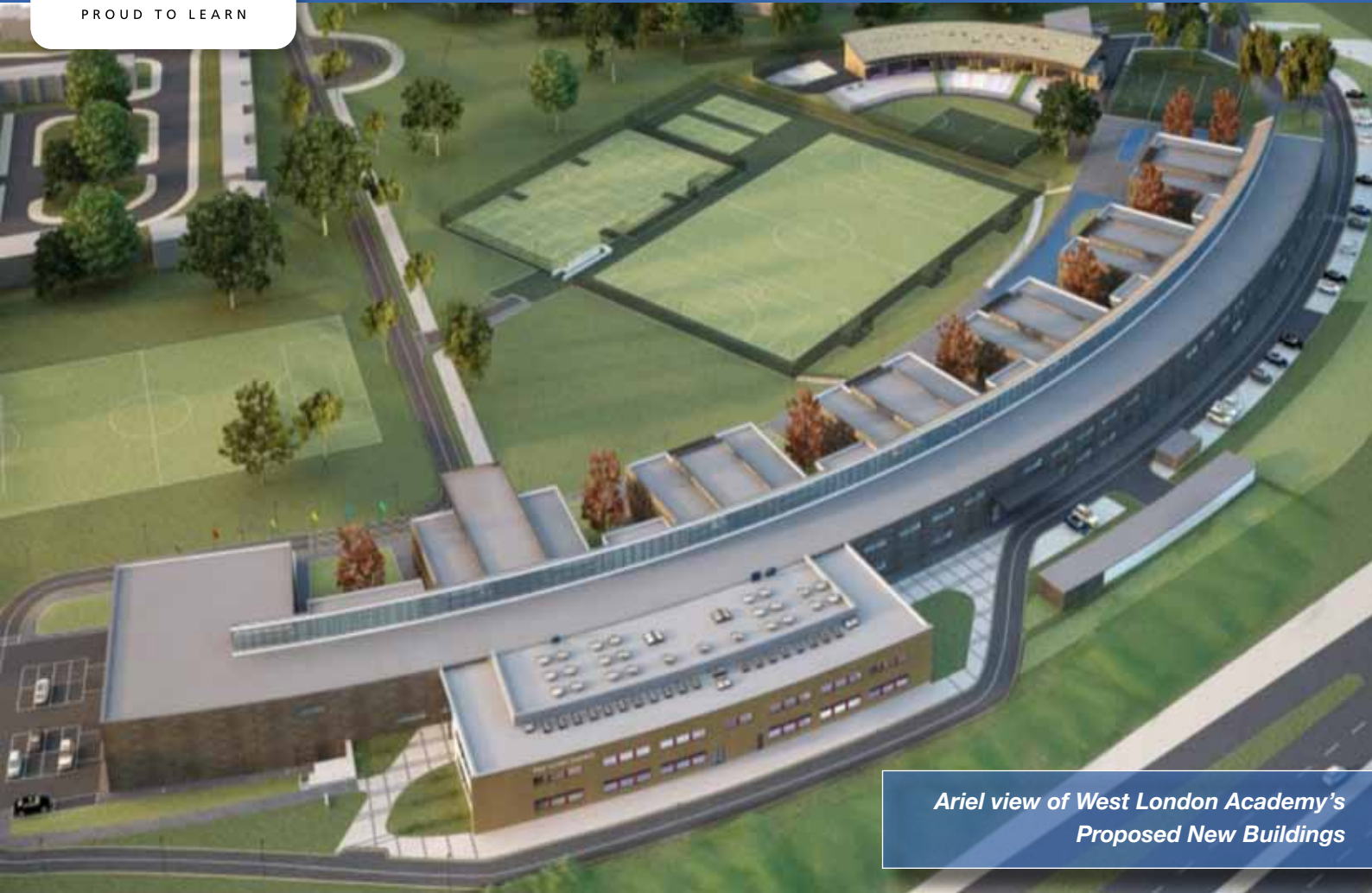
Ariel view of West London Academy's Proposed New Buildings